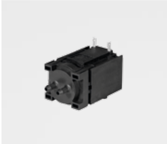
LMF Liquid Linear Pump