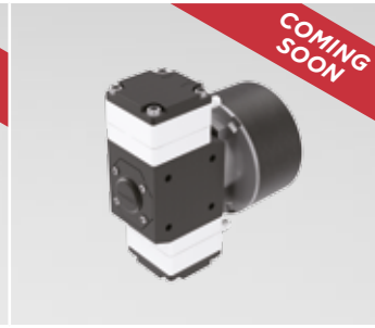
6420 Liquid Diaphragm Pump