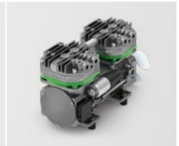
8221 Gas Diaphragm Pump