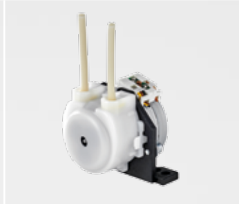
SR 10/30 Liquid Peristaltic Pump