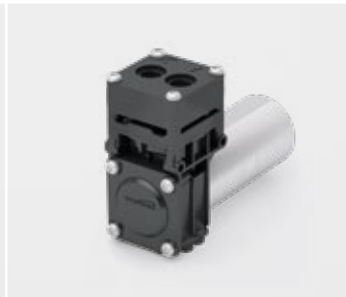
1610 Gas Diaphragm Pump