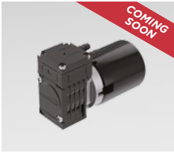
6311 Liquid Diaphragm Pump