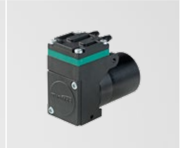
1410 Gas Diaphragm Pump