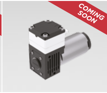
6410 Liquid Diaphragm Pump