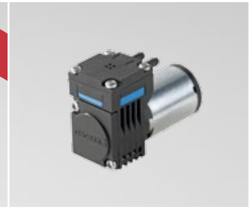
1210 Liquid Diaphragm Pump