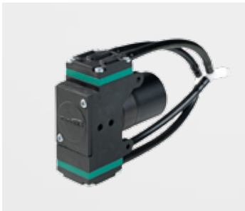
1420 Gas Diaphragm Pump